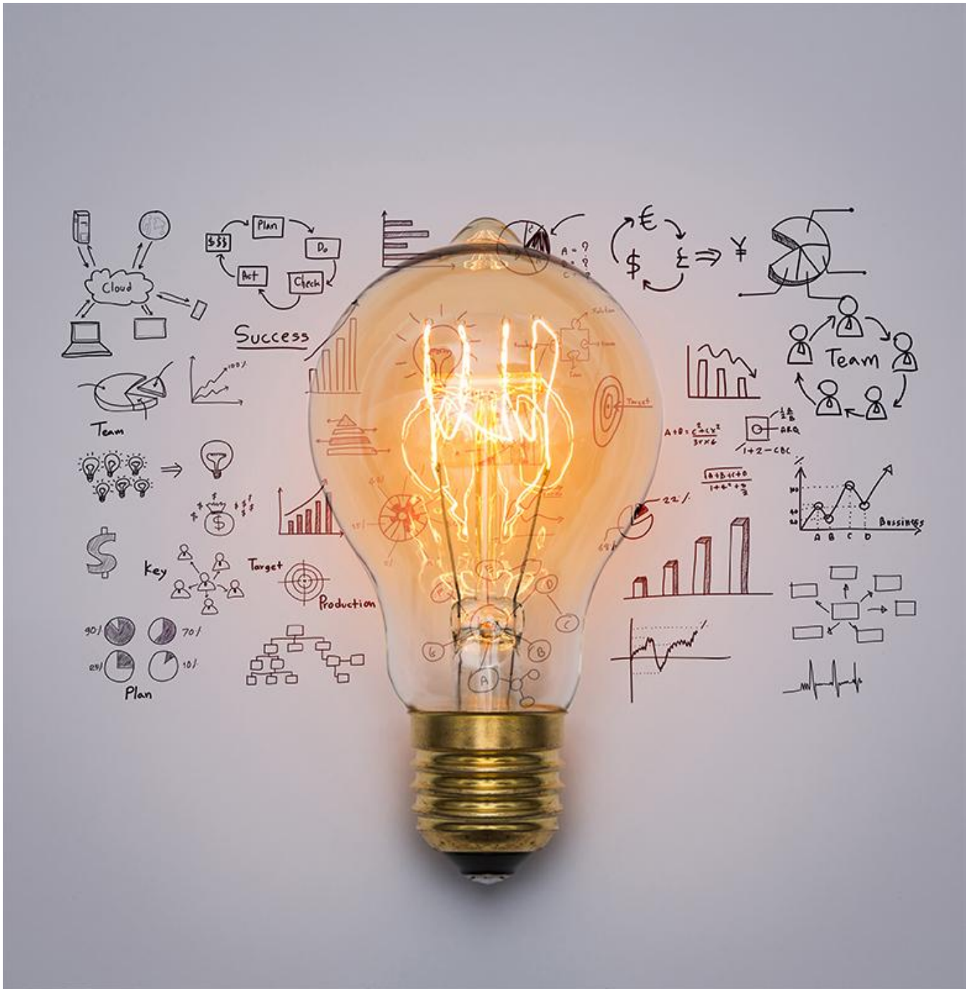
Zoom on ...